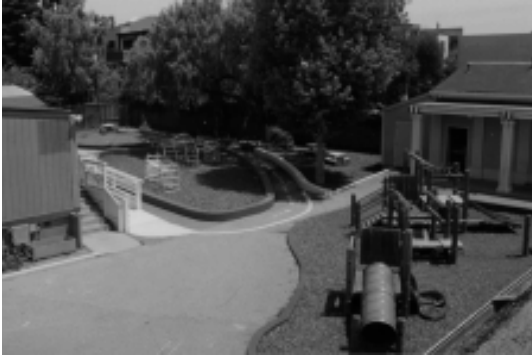
The playground prior to any renovation work

The San Francisco Conservation Corps began the renovation of our playground in June. The project will completely renovate our two play structure areas, install a shade over the existing sandbox and create an accessible ramp into the sandbox. The tanbark that we have been using will be removed and rubber matting will be installed in the fall areas around the new playground structures. The renovation to the playground was precipitated by recent changes to safety codes by the State of California. All playgrounds must meet or exceed these codes by 2005.