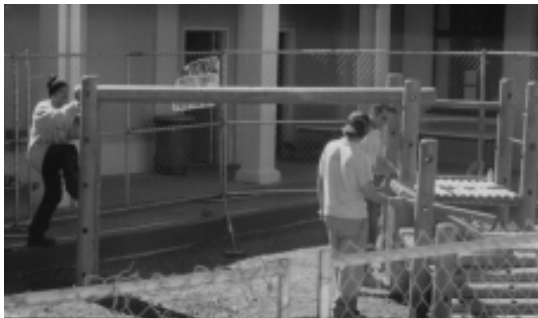
Tearing out the old equipment

The Day Home was selected as one of 12 playground renovations projects the San Francisco Conservation Corps will be completing in their 2001-2002 training cycle. The Corps uses the renovation projects as a part of their job training program. In addition to the work of the Corps for our renovation, we have also received funding from the California Department of Education and the Child Care Facilities Fund.