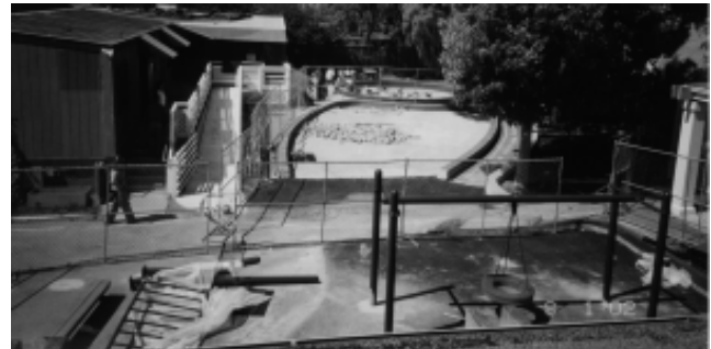
New tire swing and safety matting

During the renovation project, both teachers and children have been patient with the temporary loss of the playground. Teachers have instead taken their classes to playgrounds in the area to give children a chance to develop their gross motor skills.