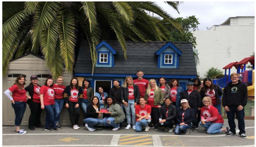
Levi's volunteers presenting a $1,000 grant to the Day Home after a fun day of volunteering.