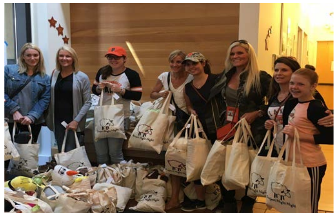
SF Giants' families distributing Project Night Night Bags to all 154 children.